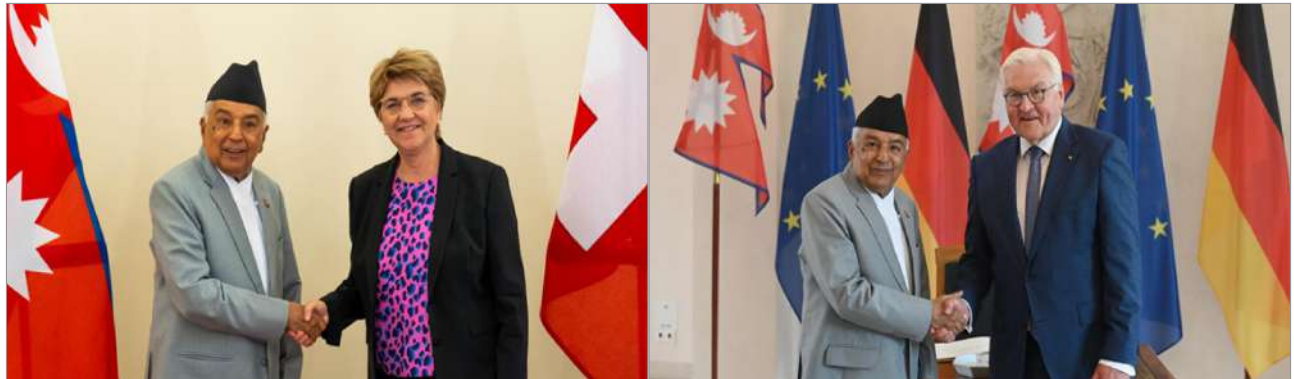
President of Nepal with Presidents of Switzerland (left) and Germany (right)

The President also visited German Research Centre for Geosciences (GFZ), Potsdam Institute for Climate Impact Research (PIK) and Research Institute for Sustainability (RIFS) in Germany.