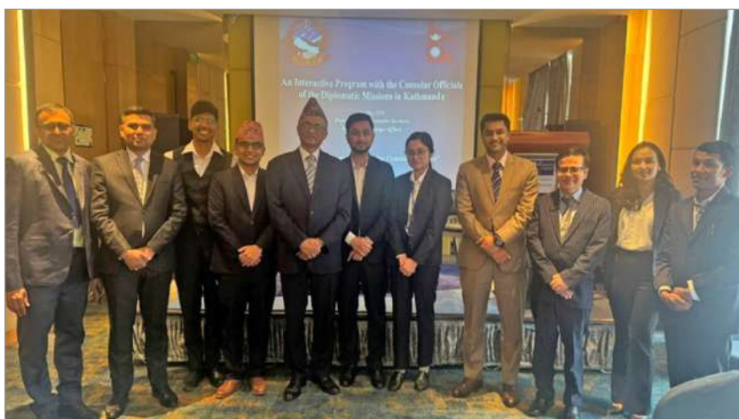
The Department team at the interaction program

and exemption services for those missions. More than 60 diplomats, consular officers and officials from various diplomatic missions, and international and regional bodies including, SAARC, ADB, and UN participated in the program.