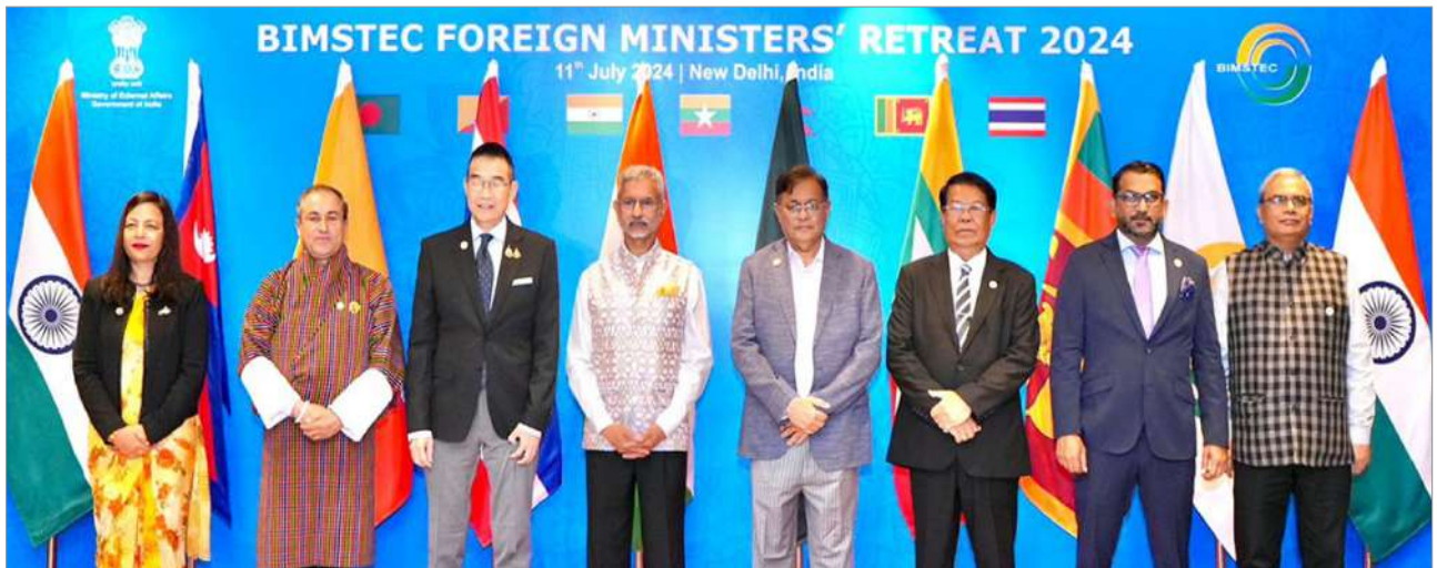
Ministers and Dignitaries participating in the Retreat