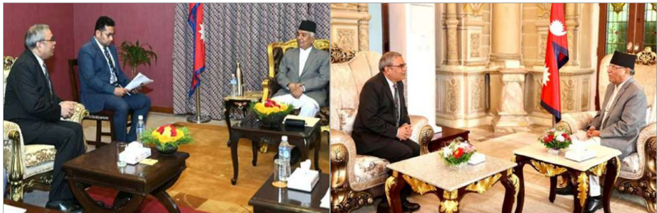
BIMSTEC Secretary General during calls-on with the President and the Prime Minister

“Harnessing Regional Synergies for Development and Prosperity in the BIMSTEC Region” at an event organized by the Centre for Economic Development and Administration (CEDA) at Tribhuvan University on 20 May 2024.