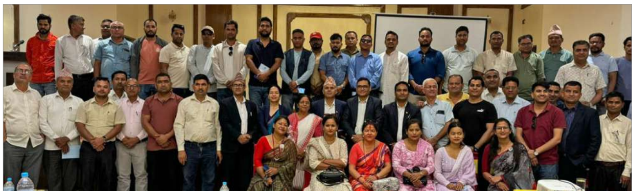
Attendees of the Program on Economic Diplomacy

officials from the provincial government, and representatives from the industrial and tourism sectors of the province.