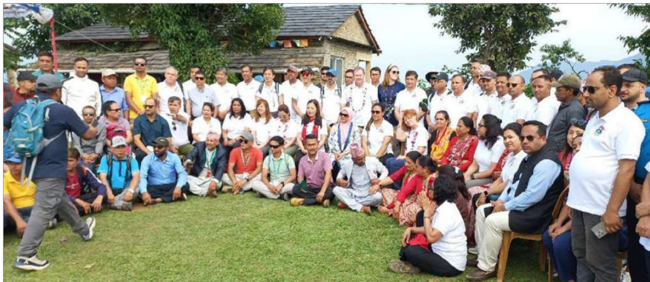
Attendees at the Eco-Village in Astam

The first day involved a brief hike around Dhampus and a subsequent dinner hosted by the Deputy Prime Minister and Minister for Foreign Affairs and also attended by