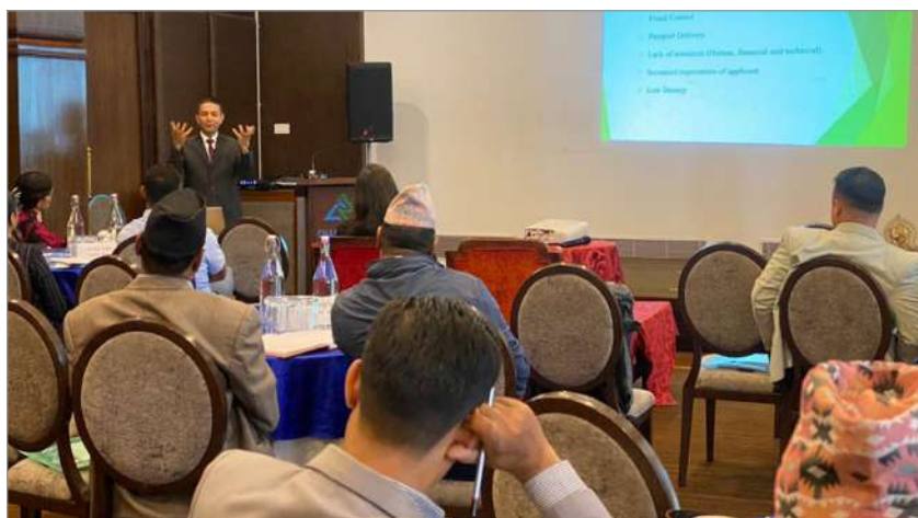
Presentation during the program

With a view to make e-passports related service delivery more people friendly and smooth in the coming days, the Department of Passports organized a province level program entitled “Passports of Nepal: Way Forward” on 29 June 2024 in Kathmandu. Participants in the program included Chief District Officers and other representatives of District and Area Administration Offices of Bagmati Province.