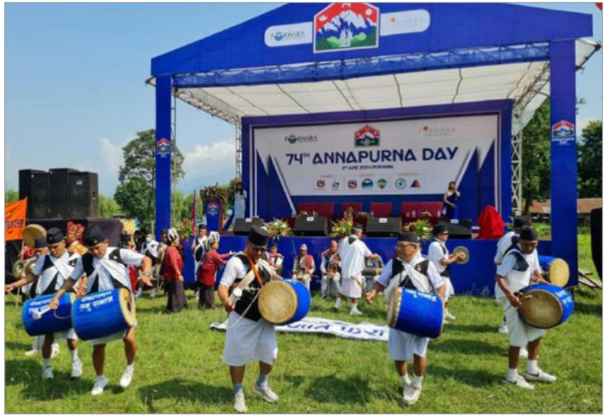
Annapurna Day Celebration

the Foreign Secretary, followed by a cultural program. On the next day, the attendees celebrated the Annapurna Day, commemorating the first successful ascent of Mt. Annapurna. Addressing the program, the Deputy Prime Minister and Minister for Foreign Affairs, highlighted the importance of Annapurna Day and emphasized Nepal's potential for tourism development. Post celebration, participants enjoyed the