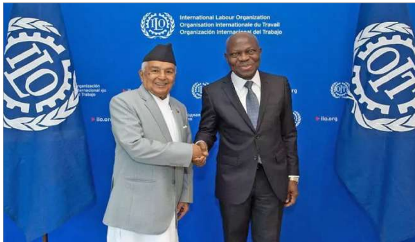
Meeting between the President and ILO Director-General

The Conference was also attended by a high-level delegation of Nepal, led by Minister of Labour, Employment and Social Security Mr. Dol Prasad Aryal. In his address to the Plenary session of the Conference on 11 June 2024, Minister Aryal expressed Nepal's commitment towards social justice and promotion of decent work in Nepal.