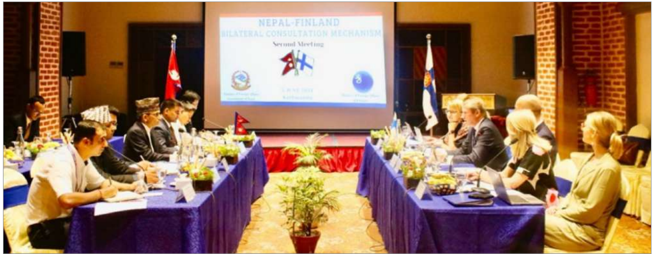
Second Bilateral Consultation Mechanism meeting between Nepal and Finland

delegations to the meeting. During the meeting, the two sides discussed different aspects of