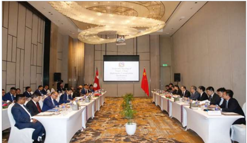
16 th Meeting of Nepal-China Diplomatic Consultation Mechanism in Kathmandu