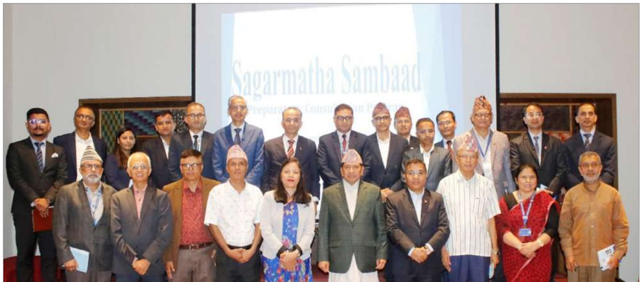
DPMFM Shrestha and Foreign Secretary with the participants of the program

secretaries, former Ambassadors, the Executive Director of the Institute of Foreign Affairs, the Executive Chairperson of the Policy Research Institute participated in the consultation and provided their inputs and feedback.