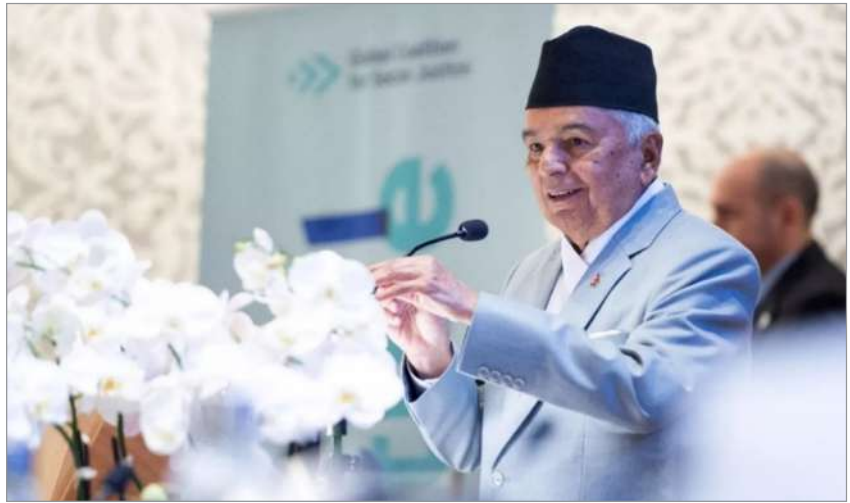
The President delivering statement in the 112 th International Labour Conference

During the visit, President Mr. Paudel held meeting with the ILO Director-General Mr. Gilbert