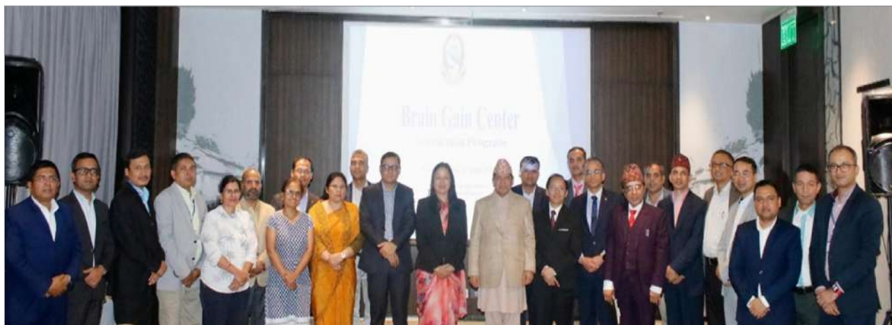
DPMFM Shrestha and Foreign Secretary with the participants

The Ministry of Foreign Affairs organized an interaction program on the Brain Gain Center in Kathmandu on 5 July 2024. Held with the objective of rejuvenating the centre, the consultation session was led by the Deputy Prime Minister and Foreign Minister Mr. Narayan Kaji Shrestha. It was