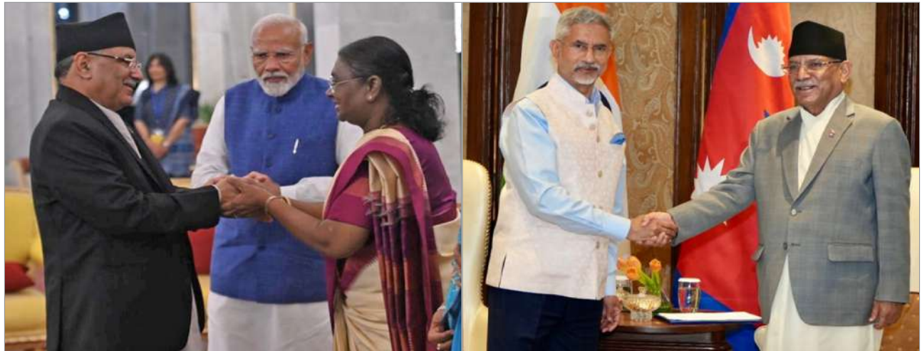
Prime Minister with the President and the Prime Minister of India (left) and with Minister Dr. S. Jaishankar (right)

India Dr. S. Jaishankar, who was later assigned the portfolio of the Minister for External Affairs, paid a courtesy call on the visiting Nepali Prime Minister.