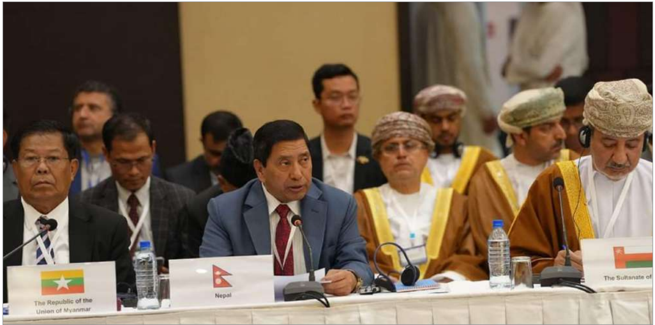
DPMFM Shrestha addressing the Ministerial Meeting

Declaration. The Ministerial Meeting was preceded by the Senior Officials Meeting on 23