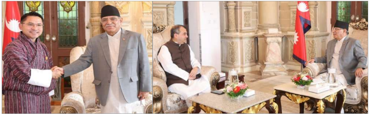
Prime Minister of Nepal with visiting Ministers of Bhutan (left) and Bangladesh (right)

Kamal Dahal 'Prachanda' in Singha Durbar.