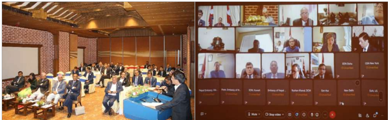
Dignitaries participating in the interaction (left), participating from Nepali Missions abroad (right)

synergy among all stakeholders to promote the common goal of facilitating the growth of Nepal's potentials in trade and investment sector. Delivering concluding remarks, Deputy Prime Minister and Minister for Foreign Affairs Mr. Narayan Kaji Shrestha stressed the growing need of promoting economic interests of the nation by Nepali missions abroad, in collaboration with relevant government agencies and private sector in Nepal.