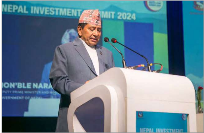
DPMFM Shrestha delivering concluding remarks to the Summit

Prime Minister Mr. Pushpa Kamal Dahal 'Prachanda' addressed the inaugural session of the Summit. Nearly 2,500 participants from over 50 countries participated in the Summit which included senior officials and business persons from India and China, as well as high dignitaries of Nepal's development partners.