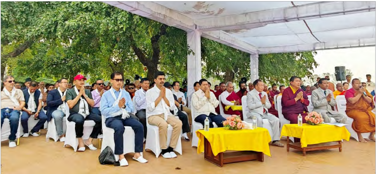
Participants attending the prayers in Lumbini