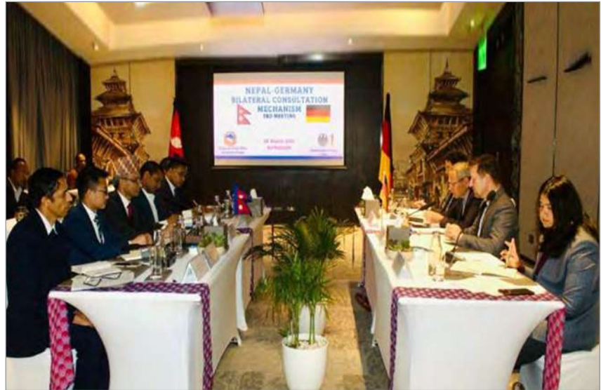
Nepali and German delegations during the meeting