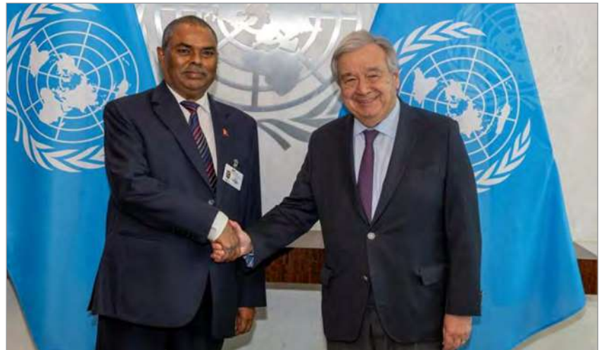
Deputy Prime Minister Yadav with the UN Secretary General

He also highlighted the priority and importance given by Nepal on the implementation and attainment of the Program of Action since its adoption in 1994. He underscored various policies, plans and programs Nepal has