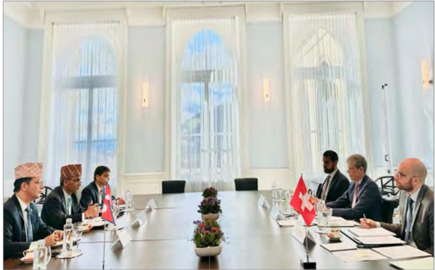
Nepali and Swiss delegations during the meeting