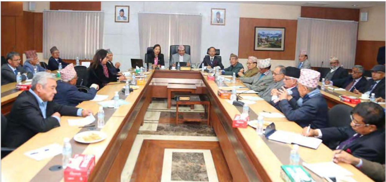
Former Ambassadors of Nepal participating in the interaction

on the continuity, consistency and reliability of foreign policy and foreign relations behaviours. The DPMFM thanked the Ambassadors for their feedback and inputs for further enhancing the conduct of Nepal’s foreign relations.