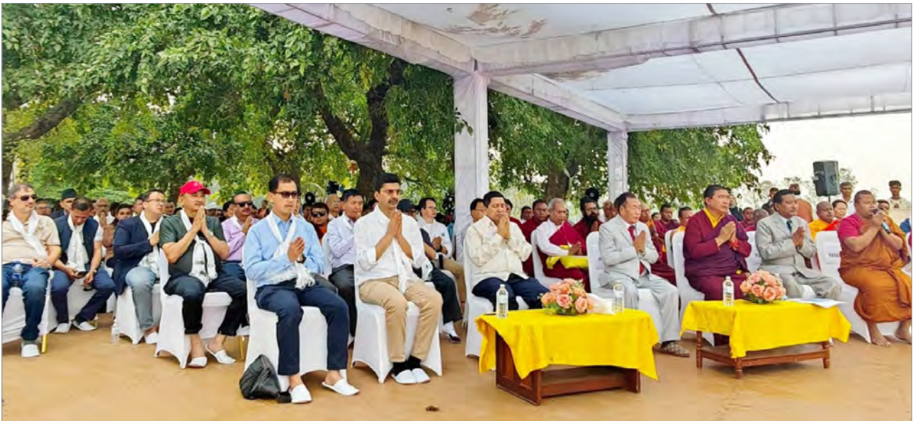
Participants attending the prayers in Lumbini