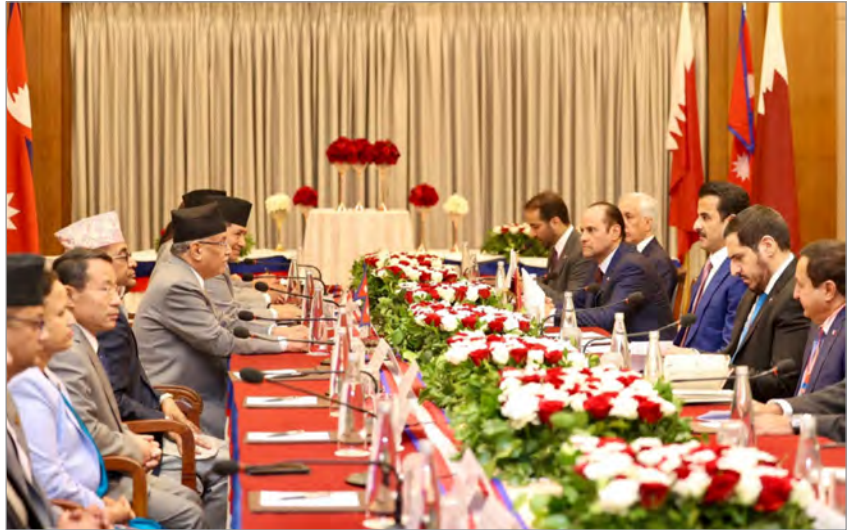
Delegations led by Nepali Prime Minister and the Qatari Amir during the talks

Diplomatic Institute of the Ministry of Foreign Affairs of