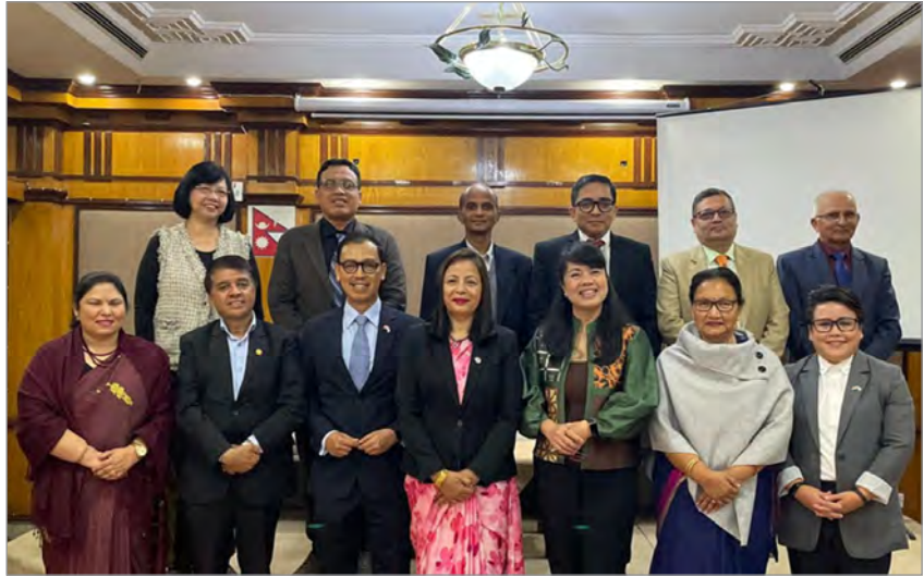
Foreign Secretary with the Panelists of the Dialogue