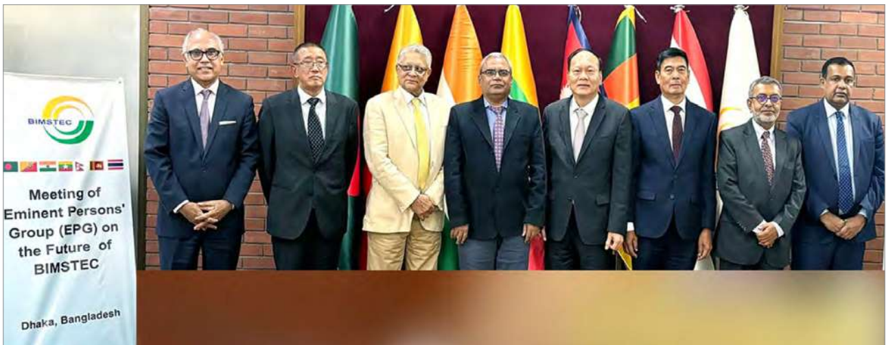
BIMSTEC EPG members during the meeting in Dhaka

agriculture and food security, people-to-people contact and connectivity.