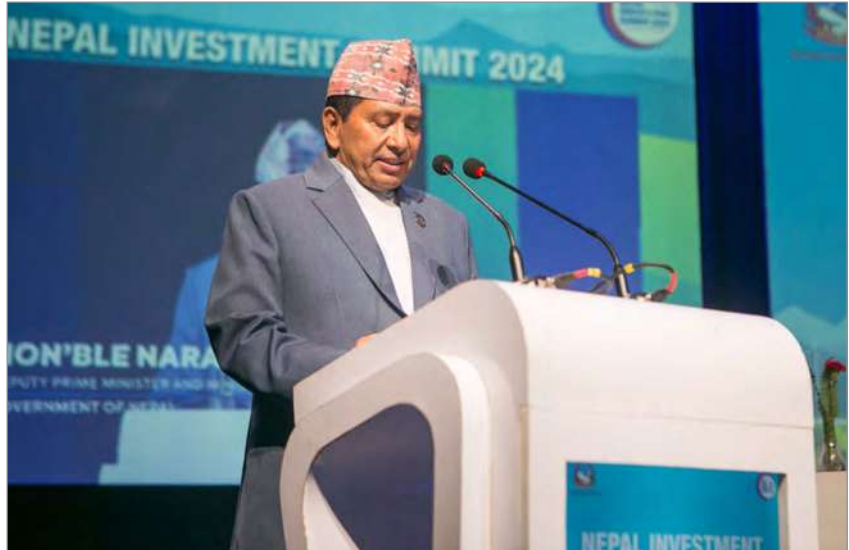
DPMFM Shrestha delivering concluding remarks to the Summit

Prime Minister Mr. Pushpa Kamal Dahal 'Prachanda' addressed the inaugural session of the Summit. Nearly 2,500 participants from over 50 countries participated in the Summit which included senior officials and business persons from India and China, as well as high dignitaries of Nepal's development partners.