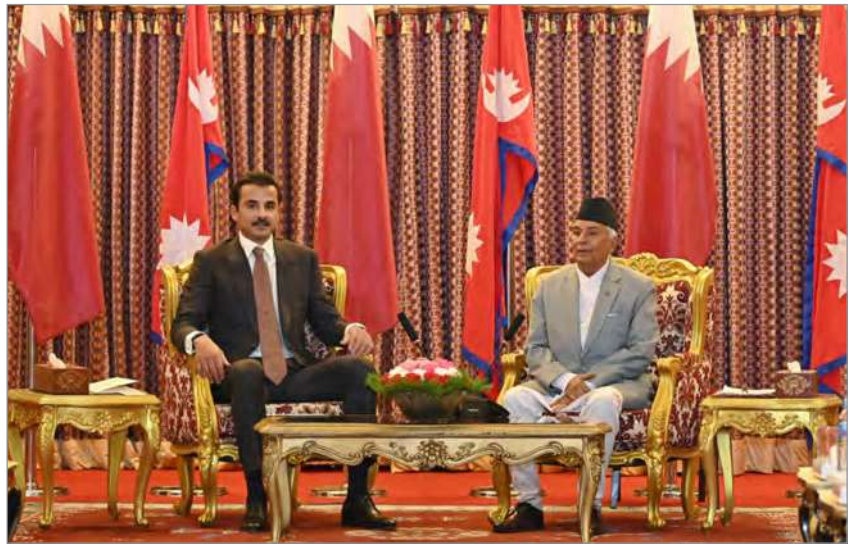
President Paudel and the Amir Al Thani

On 24 April, Prime Minister Mr. Pushpa Kamal Dahal ‘Prachanda’