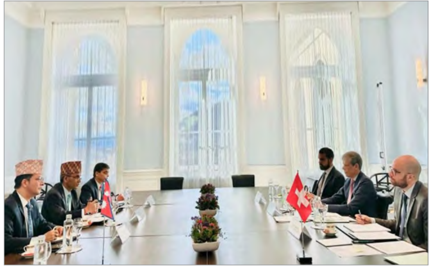
Nepali and Swiss delegations during the meeting