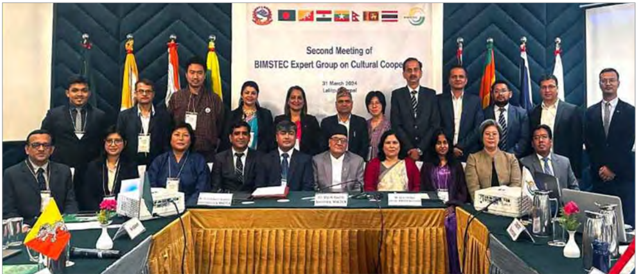
Delegates from BIMSTEC Members participate in the Meeting

preserving both tangible and intangible cultural heritages of the Member States. The Meeting also finalised Terms of Reference (ToR) of the Expert Group for its submission to the upcoming BIMSTEC Senior Officials' Meeting.