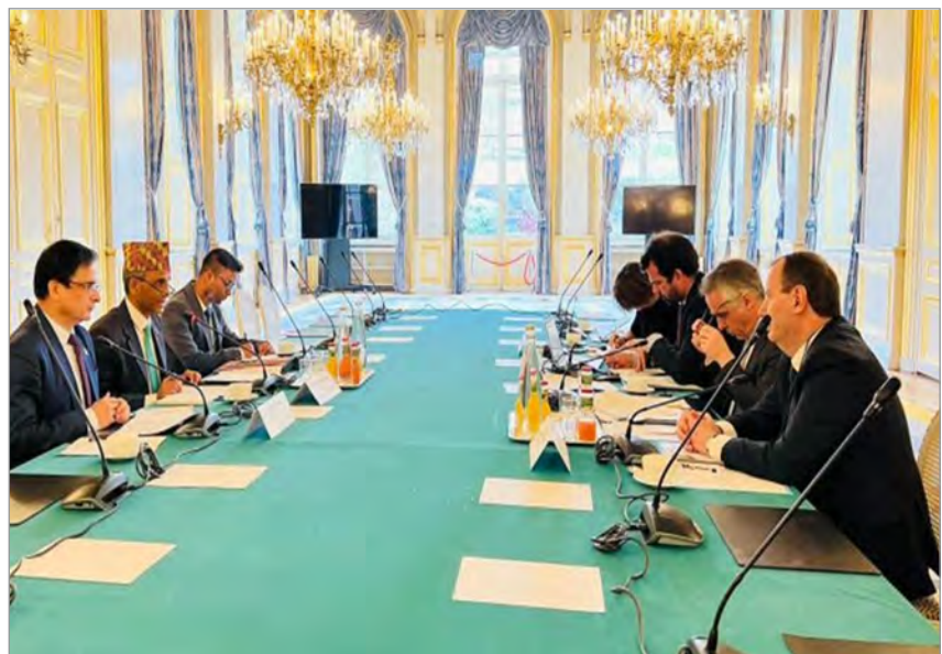
Nepali and French delegations during the meeting