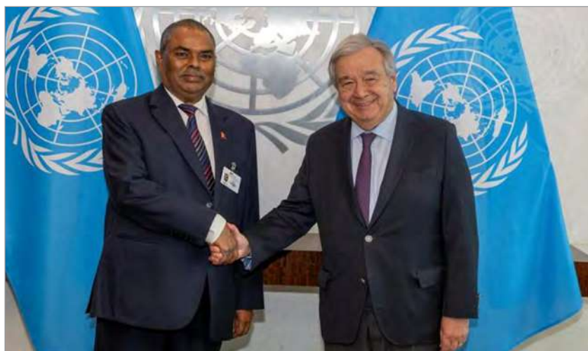
Deputy Prime Minister Yadav with the UN Secretary General

He also highlighted the priority and importance given by Nepal on the implementation and attainment of the Program of Action since its adoption in 1994. He underscored various policies, plans and programs Nepal has