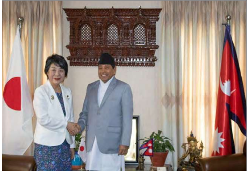
DPMFM Shrestha and Minister Kamikawa

The two leaders underscored the need to commemorate the milestone of 70 th anniversary of