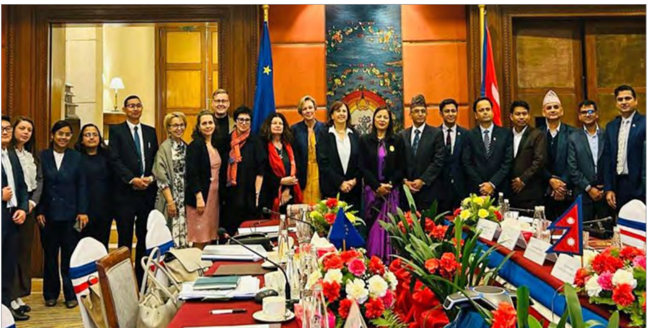
The Nepali and EU delegations during the joint commission

between Nepal and the EU, including the EU's support to Nepal, bilateral trade and investment, multilateralism, human rights, climate change, and people-to-people relations were discussed.