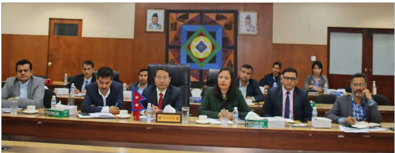
Finance Minister, Chief Secretary, Foreign Secretary and CEO of IBN in the Program

Investment Summit, 2024’ with Ambassadors and officials of