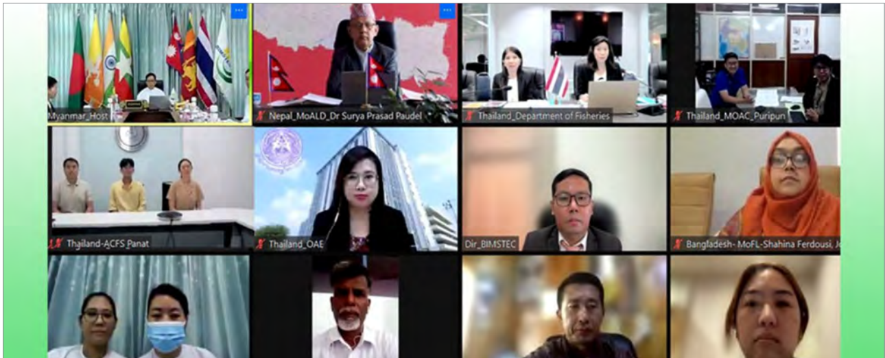
Participants during the First Meeting of the BIMSTEC Expert Group on Fisheries and Livestock

Cooperation. The Plan of Action outlines 23 actions across 4 areas of cooperation to enhance food security, safety, and nutrition.