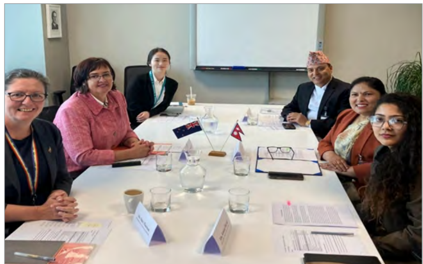
Delegation of Nepal and New Zealand during the Second FMC

During the consultation, the two sides took stock of various