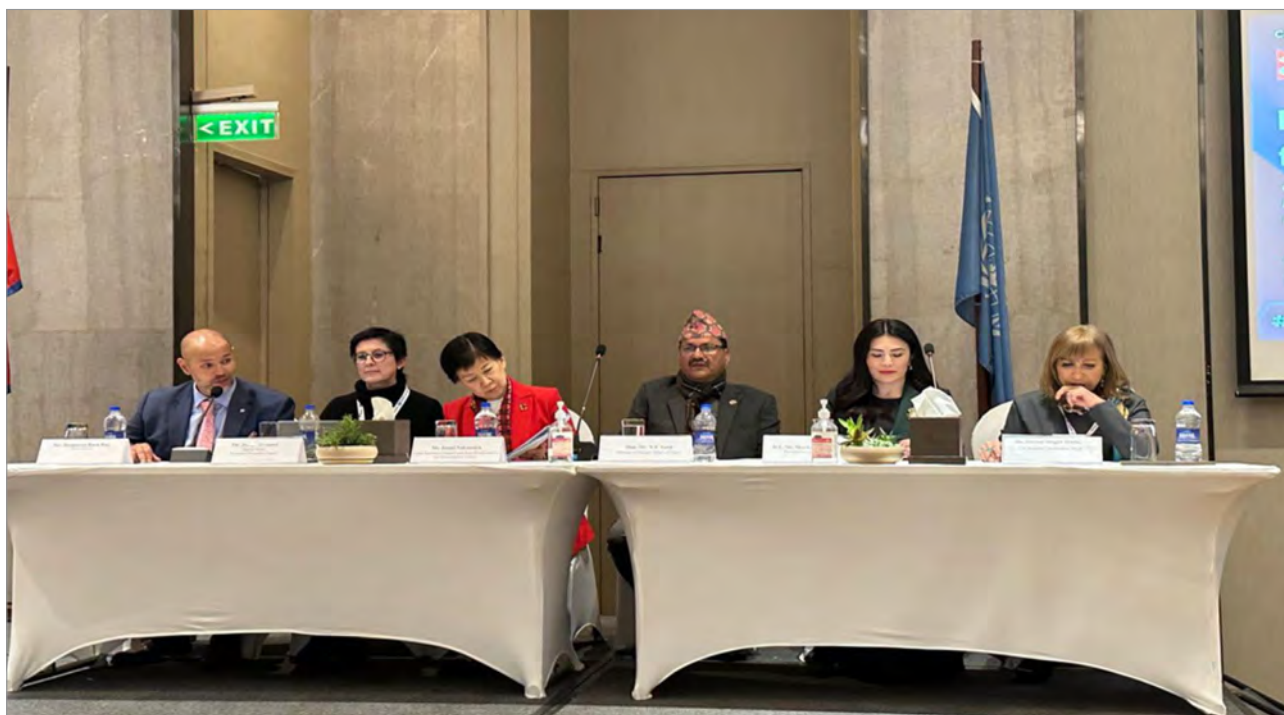
The representatives of 25 countries from the Asia and Pacific Region attending the meeting

Minister reaffirmed Nepal's total and unequivocal commitment to disarmament. Minister Saud stressed the need to strengthen national capacity, enhance regional initiatives and coordination, adapt strategies to address widespread security challenge of illicit trade and use of small arms.