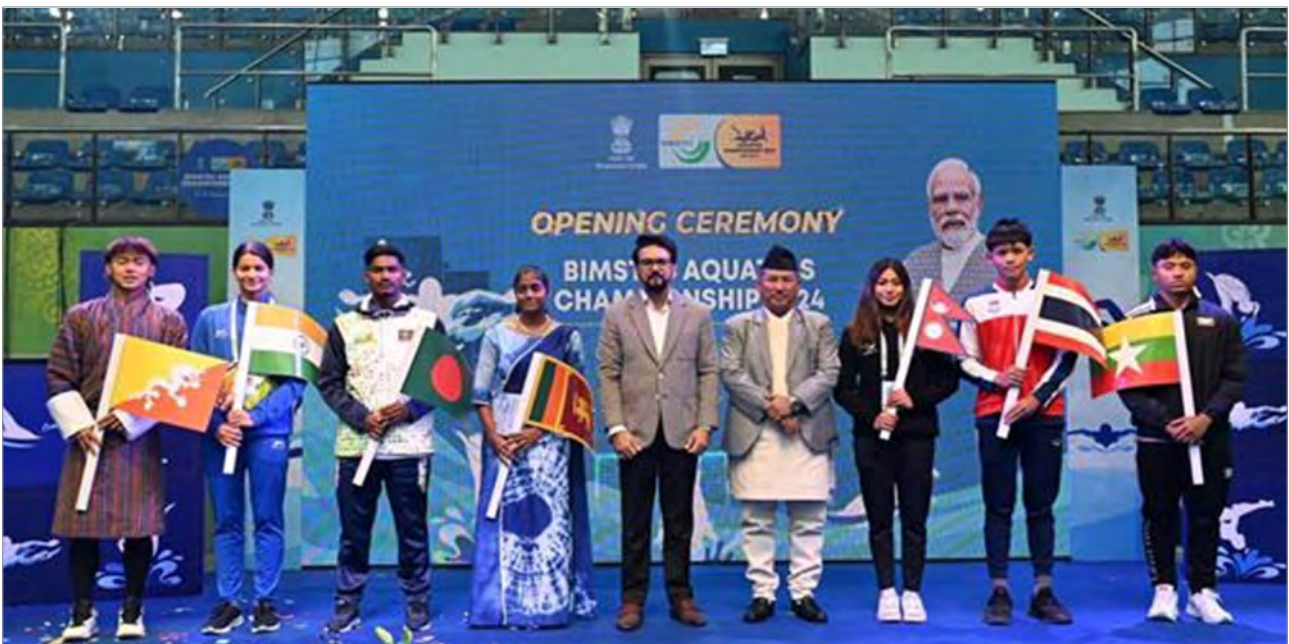
BIMSTEC Aquatic Championship 2024 opening ceremony

Singh Thakur and Minister for Youth and Sports of Nepal Mr. Dig Bahadur Limbu attended