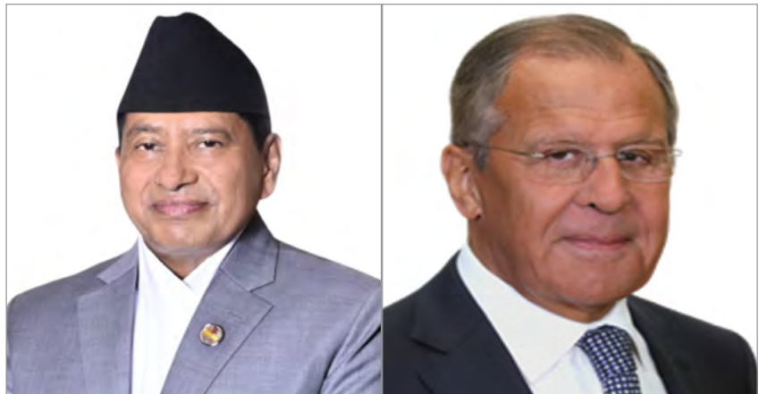
Deputy Prime Minister and Foreign Minister of Nepal and Russian Foreign Minister

Deputy Prime Minister and Minister for Foreign Affairs Mr. Narayan Kaji Shrestha held a telephone conversation with the Minister of Foreign Affairs of the Russian Federation Mr. Sergey Lavrov on 7 March 2024.