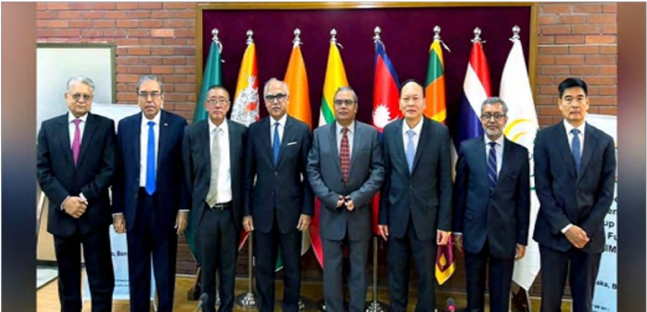
EPG Members with the Secretary General of BIMSTEC

of BIMSTEC. The members of BIMSTEC EPG from all seven member states participated in the meetings.