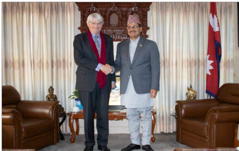
Meeting between Foreign Minister Saud and the UK Minister for Development and Africa

Earlier on 30 January 2024, the Chief of the General Staff of the British Army Gen. Sir Patrick Sanders had met with Minister Saud. Gen. Sanders was on a visit to Nepal to attend this year's