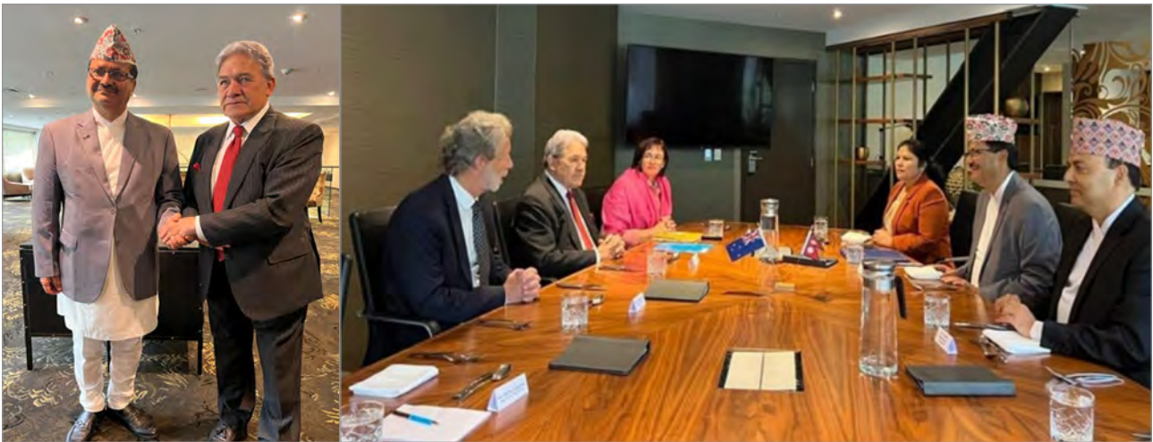
Minister Saud and Minister Peters holding bilateral meeting