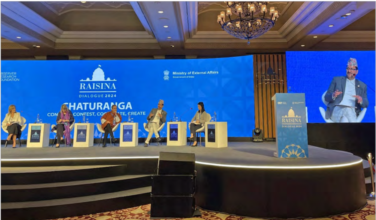
Minister Saud at the Raisina Dialogue 2024

on 23 February, Minister Saud stressed the need for creating proper platforms and developing inclusive processes to forge cooperation mechanisms that adequately address the financial divide between nations. Among other things, he highlighted the need for both South-South and North-South cooperation to realise the sustainable development goals.