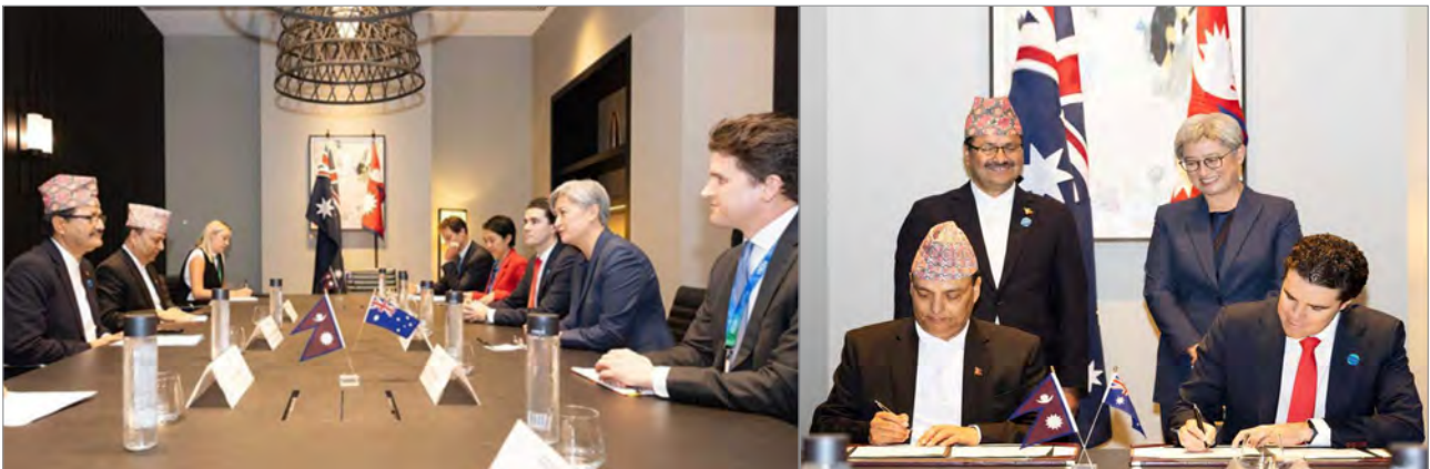
Foreign Ministers of Nepal and Australia during bilateral meeting and the signing of TIFA

on 9 February 2024. The two Ministers exchanged views on matters of mutual interest.