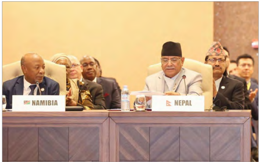
Prime Minister Mr. Pushpa Kamal Dahal 'Prachanda' addressing the NAM Plenary Session

Prior to the Summit, the NAM Ministerial meeting was held on 16 and 17 January 2024. Foreign Minister Mr. N. P. Saud led the Nepali delegation to the Ministerial Meeting. Addressing a session in the meeting, Minister Saud reiterated Nepal's commitment to NAM's objectives and principles.