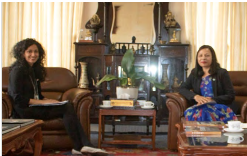
Meeting between Foreign Secretary of Nepal and US Deputy Assistant Secretary