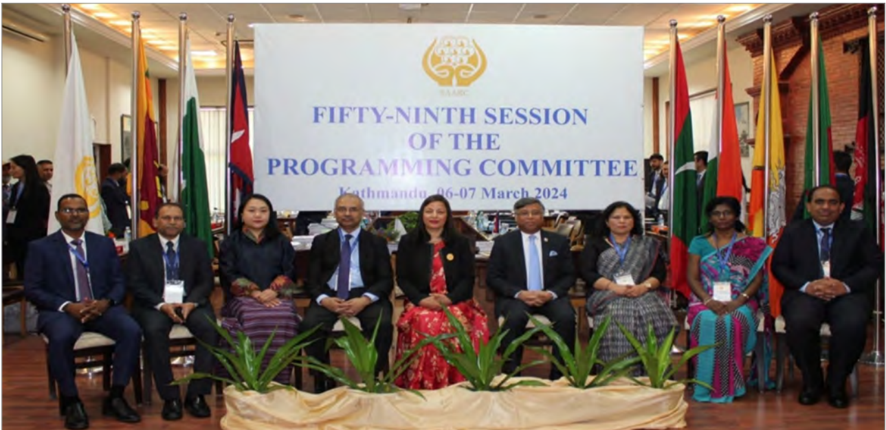
The 59 th Session of the Programming Committee of SAARC

The Programming Committee reviewed the status of regional cooperation in the identified