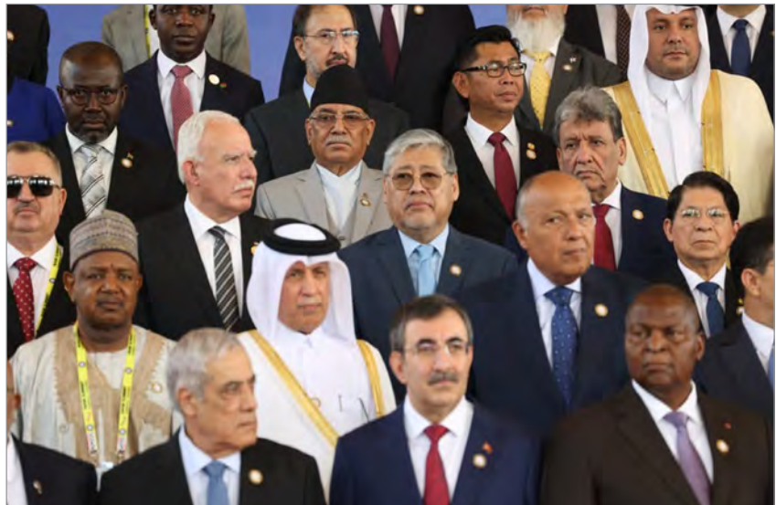
Prime Minister Mr. Pushpa Kamal Dahal 'Prachanda' with NAM Leaders at 19 th NAM Summit

Prime Minister Dahal addressed the plenary session of the Summit on the theme 'Deepening Cooperation for Shared Global Affluence' on 19 January 2024. In his address, the Prime Minister underlined Nepal's longstanding commitment to the principles and values of non-alignment. While highlighting Nepal's independent, objective, balanced and non-aligned foreign policy rooted in sovereign equality, mutual respect and peaceful settlement of disputes, he reaffirmed Nepal's solidarity with the Movement. He stressed