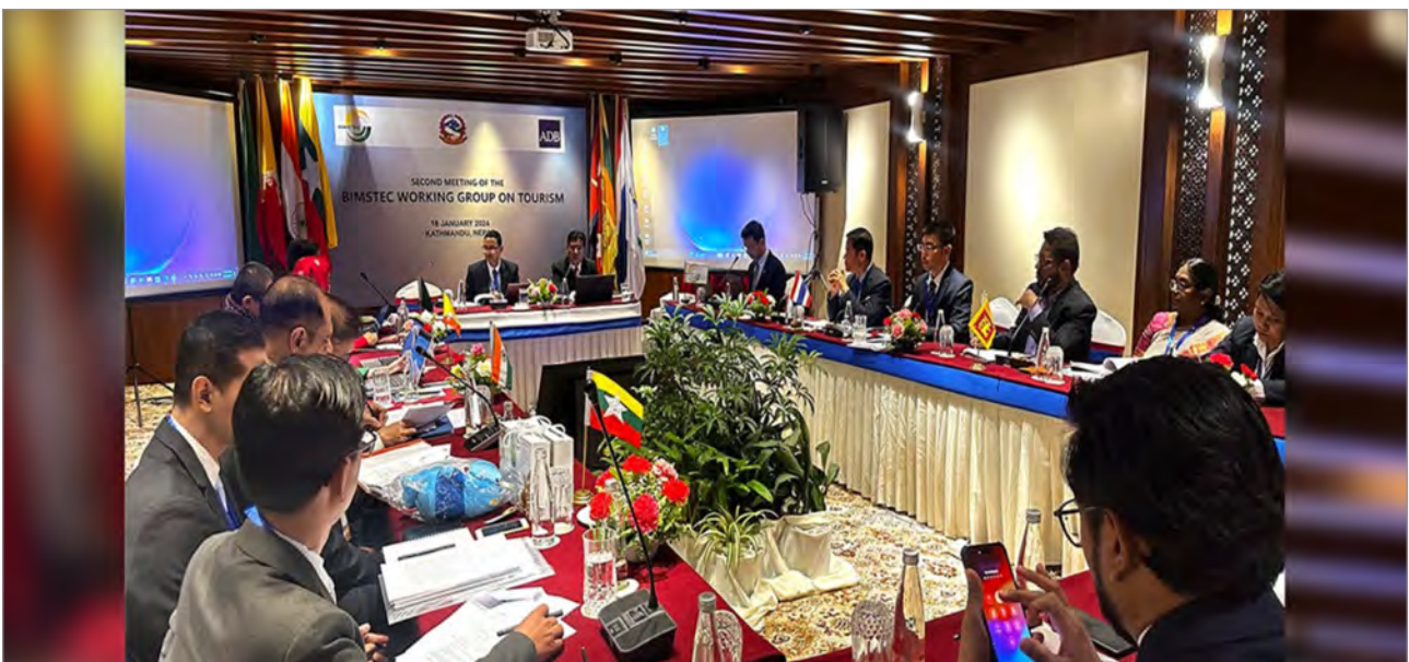
Second Meeting of the BIMSTEC Expert Group on Tourism

also made important decisions regarding the operationalization of the Virtual BIMSTEC Tourism Fund and BIMSTEC Tourism Information Center, among others.