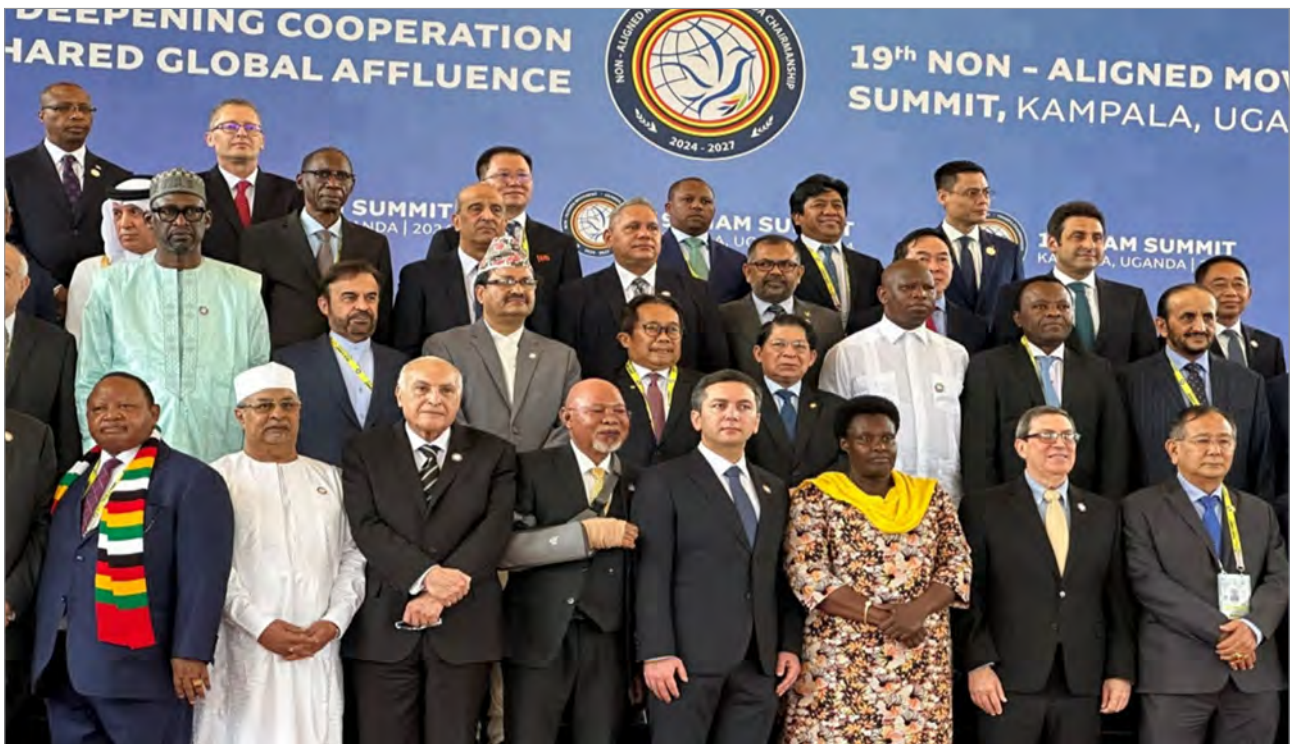
Foreign Minister Mr. Saud attending the Ministerial Meeting

COVID-19 pandemic, climate change, economic nationalism, hunger, conflicts, and resurging geopolitical competition, among others.