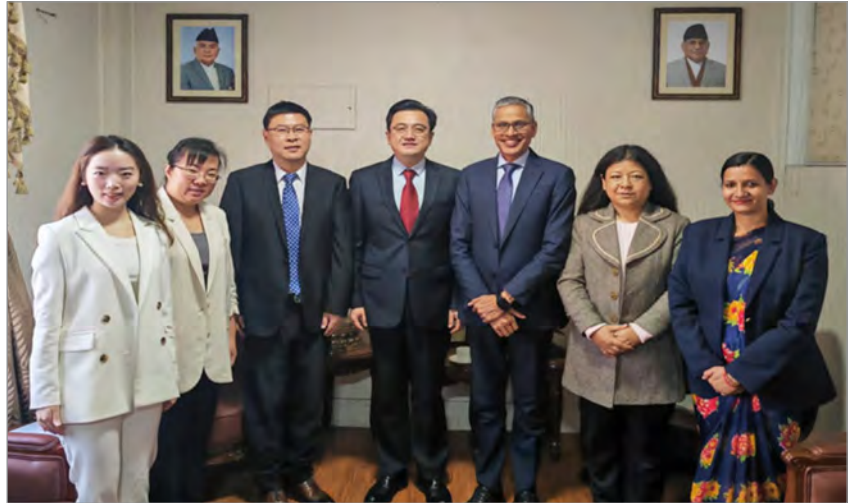
CIDCA Delegation with Senior MoFA Officials