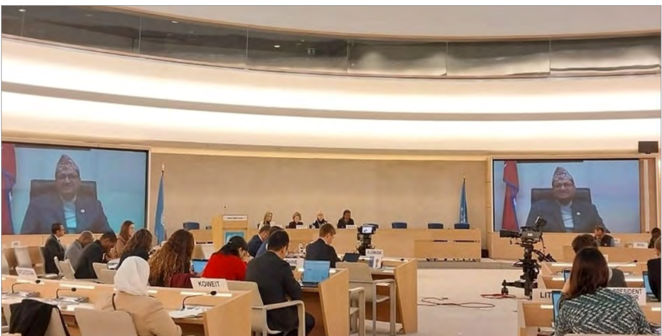
Foreign Minister addressing the High-Level Segment

human rights front and ensured Nepal’s commitment to early concluding the last mile tasks of nationally led peace process including transitional justice process by upholding the victim-centric approach in consultation with all stakeholders.