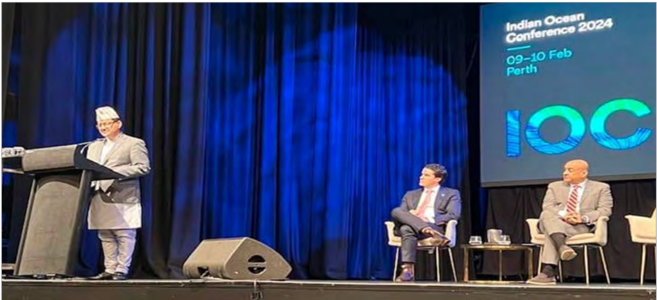
Minister Saud addressing the conference

On the sidelines of the Conference, Foreign Minister Mr. Saud held