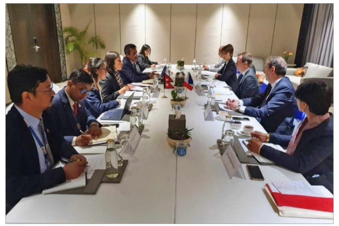
Third meeting of Nepal-France Bilateral Consultation Mechanism

infrastructure, protecting forests, and incorporating climate change adaptation