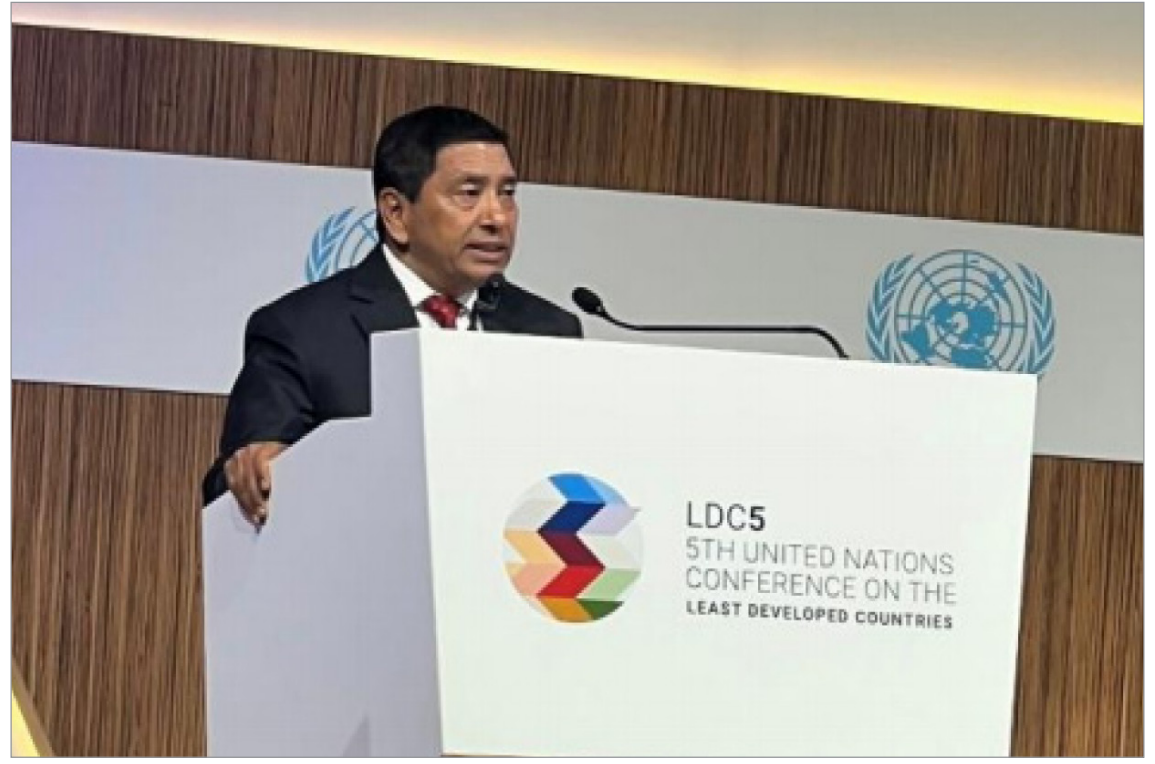
Deputy Prime Minister Mr. Narayan Kaji Shrestha speaking at the 5th UN Conference on the LDCs

Prior to the Conference, the Deputy Prime Minister addressed the Summit of the Least Developed Countries, and delivered a keynote speech in the program commemorating fifty years of the creation of the LDC