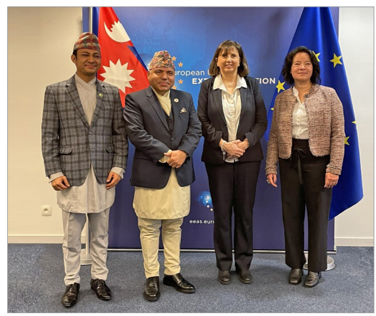
14th Nepal-EU Joint Commission held in Brussels

The meeting discussed a range of topics including the strengthening of bilateral ties, trade relations, investment potential, air safety, people-to-people contacts, global climate