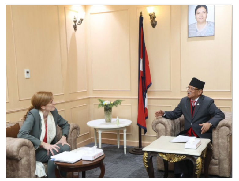
Prime Minister Mr. Pushpa Kamal Dahal 'Prachanda' receiving USAID Administrator Ms. Samantha Power

During the meeting with the Foreign Minister, they discussed various aspects of Nepal-US relations and cooperation. The Foreign Minister thanked the US government for the continued cooperation in Nepal's socioeconomic development and for the vaccines and medical provided items during COVID-19. While