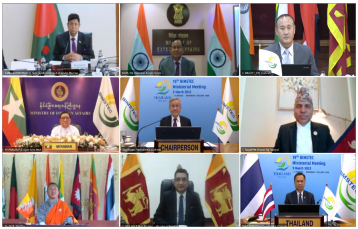
19th Ministerial Meeting of BIMSTEC

of the BIMSTEC Permanent Working Committee (B-PWC).