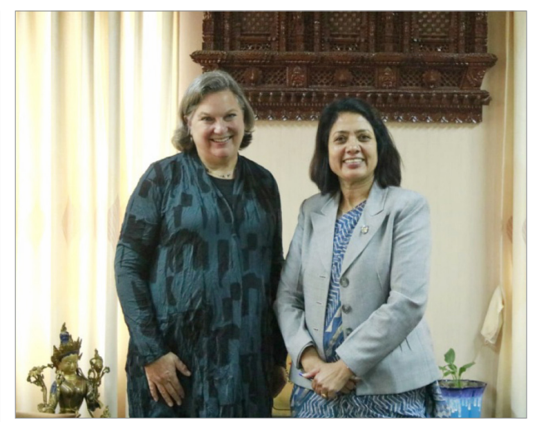
US Under Secretary of State for Political Affairs with the Foreign Minister

of Nepal-US friendship and cooperation. The discussion also covered Nepal's development priorities and the role of trade and investment in the development path of Nepal.