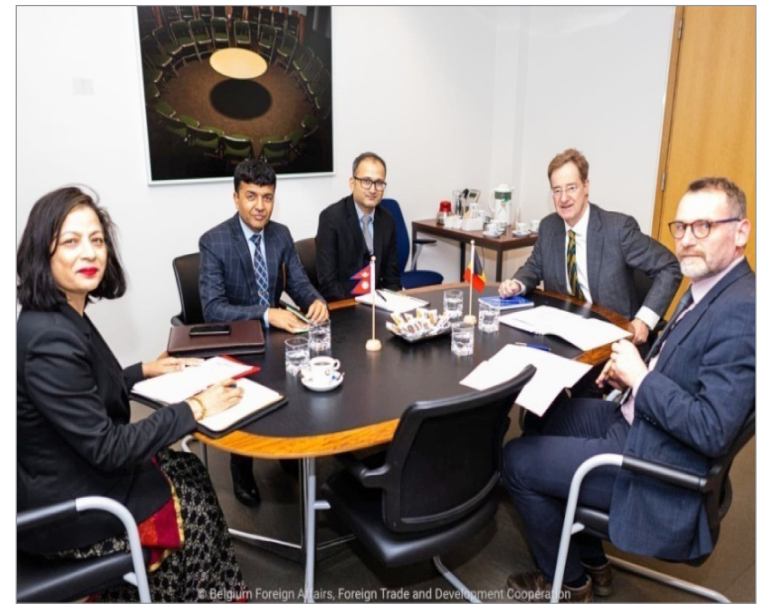
Second Meeting of Nepal-Belgium Bilateral Consultation Mechanism held in Brussels

The meeting covered bilateral relations, global issues such