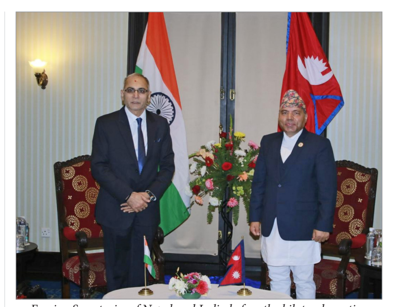
Foreign Secretaries of Nepal and India before the bilateral meeting

During the meeting, the two Foreign Secretaries reviewed various aspects of Nepal-India relations covering connectivity, trade and transit, power sector cooperation, agriculture, education, culture, health