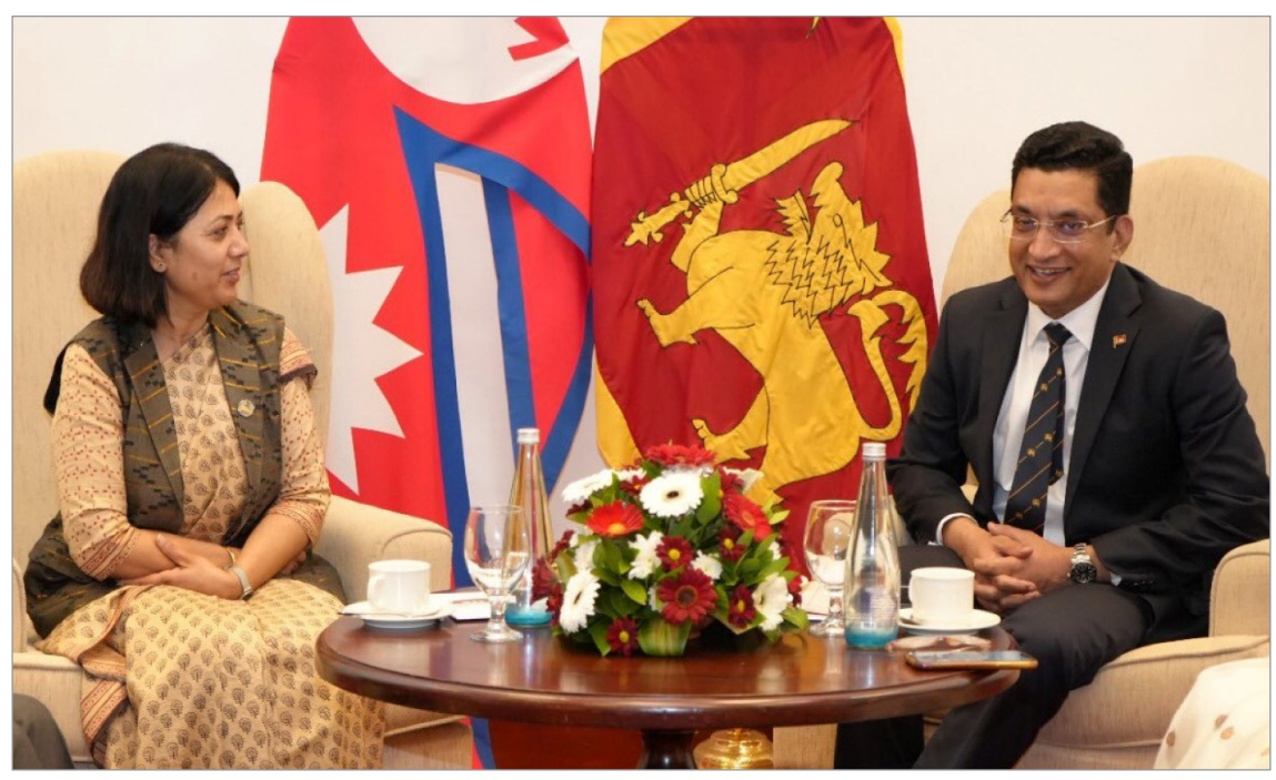
Foreign Minister of Nepal meeting with the Foreign Minister of Sri Lanka

The Foreign Minister participated in the luncheon hosted by the Foreign Minister of Sri Lanka at Galle Face Hotel, Colombo together with other Ministers from participating countries. On the occasion, the Ministers