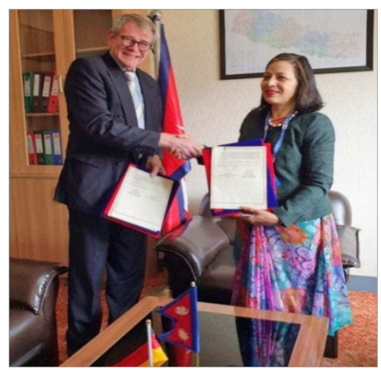
Signing ceremony of the MOU between MOFA and German Embassy on operation of the GZK

the Embassy of the Federal Republic of Germany in Nepal on the continued operation of the Goethe-Zentrum Kathmandu (GZK) on 10 February 2023. The GZK through its activities has been promoting people to people relations between Nepal and Germany. The MOU is an important step in further promoting educational linkage between Nepal and Germany.