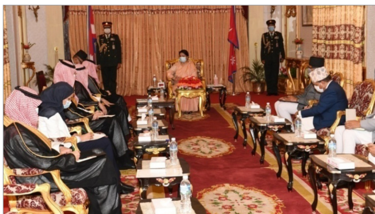
Prince Faisal bin Farhan Al Saud and the Saudi Arabian delegation during the courtesy call on the President.

Similarly, the Foreign Minister also paid a courtesy call on the Prime Minister Mr. Sher Bahadur Deuba. During the call, Prime Minister Mr. Deuba extended best wishes for the success of the Saudi Vision 2030 and