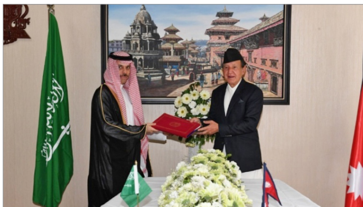
Dr. Narayan Khadka, Minister for Foreign Affairs and Prince Faisal bin Farhan Al Saud, Minister of Foreign Affairs of Saudi Arabia during the signing ceremony

The two Foreign Ministers also signed General Cooperation Agreement between the Government of Nepal and the Government of the Kingdom of Saudi Arabia. The Agreement aims to enhance cooperation in the field of economy, commerce, investment, education, science, technology, tourism, youth and sports.