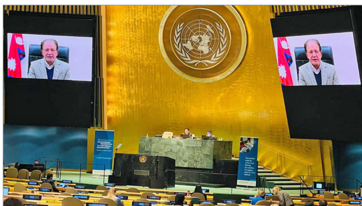
Minister for Foreign Affairs addressing the High-Level Thematic Debate on Galvanizing Momentum for Universal Vaccination

Dr. Narayan Khadka, Minister for Foreign Affairs addressed the High-Level Thematic Debate on Galvanizing Momentum for Universal Vaccination convened by the President of the General Assembly through a pre-recorded video message on 25 February 2022. In his statement, Mr. Khadka called for a strong push to make vaccines accessible and affordable to all. Foreign Minister underscored that