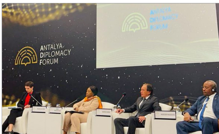
Foreign Minister participates in Antalya Diplomacy Forum