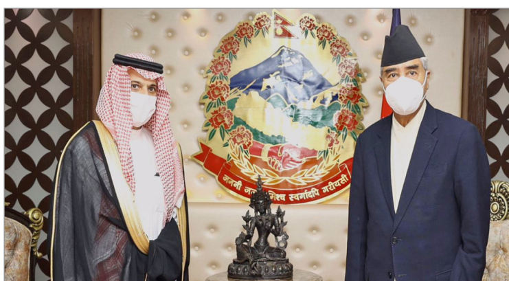
Prince Faisal bin Fahran Al Saud with the Prime Minister

Minister for Foreign Affairs Dr. Narayan Khadka held a bilateral meeting with Prince Faisal bin Fahran Al Saud in the Ministry of Foreign Affairs. The two Foreign Ministers discussed the diverse areas of bilateral relations and underlined the need to further explore possibilities of cooperation, including in the field of foreign employment, welfare and interest of Nepali migrant workers.