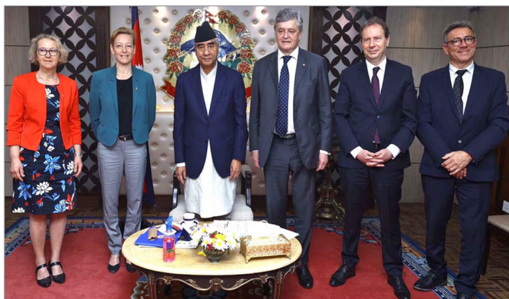
French Parliamentary delegation meets the Prime Minister