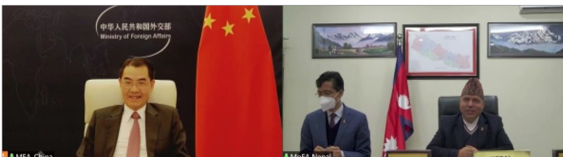
Assistant Foreign Minister Mr. Wu Jinghao and Foreign Secretary during the virtual meeting

Foreign Minister of the People's Republic of China,