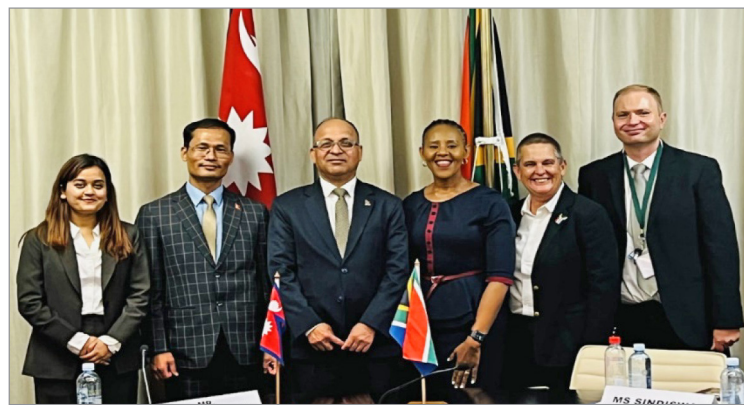
Members of delegations of Nepal and South Africa for inaugural Bilateral Consultations

The meeting encompassed a wide range of bilateral relation issues such as trade, tourism, foreign direct investment, people-to-people contact, and cultural cooperation among others.