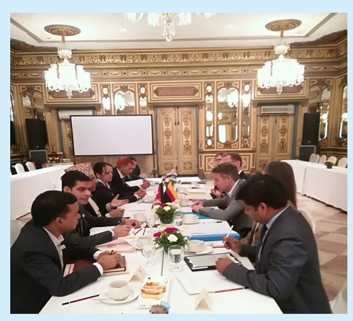
Nepali and German delegations during the bilateral consultations

The two sides stressed the need for intensifying trade and foreign direct investment linkages, and welcomed efforts to promote the German private sector's investments in Nepal. The German side welcomed efforts to foster an open investment climate in Nepal and pledged support in ongoing reform measures. The two sides also reviewed the international and regional situation. They agreed on the need to strengthen rules-based multilateralism and regional cooperation. The two sides acknowledged climate change as one of the most serious existential threats to humanity and agreed to promote collaboration, both at bilateral and multilateral levels.