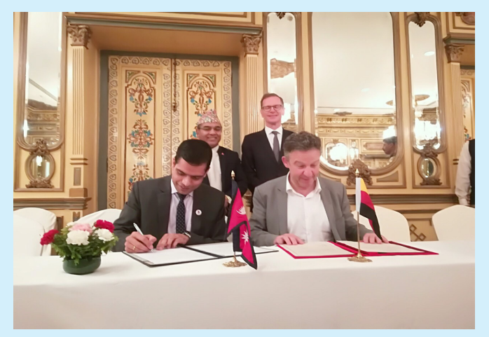
Signing of the JDI on Nepal-Germany Bilateral Consultation Mechanism

The JDI stipulates that the Foreign Ministry consultations would be held annually, alternatively in Kathmandu and Berlin at mutually convenient dates.