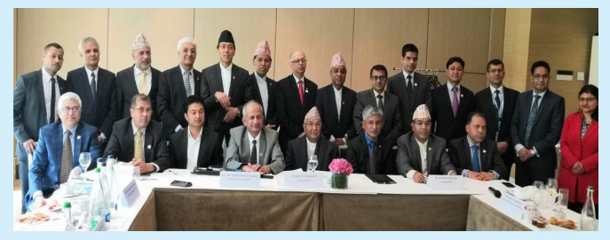
Prime Minister Oli with Europe-based Ambassadors and senior Government officials in Geneva

While expressing deep concerns over the impacts of climate change to the mountain ecology, the Prime Minister highlighted the contributions of the mountainous countries towards controlling global warming. He underlined the ways to enhance Nepal-France cooperation in tourism in the context of Visit Nepal 2020 Campaign.