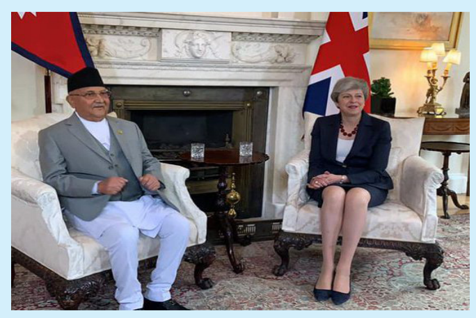
Prime Minister Oli with British Prime Minister May at the latter's office

During his visit to the UK, he held a bilateral meeting with the Prime Minister of the United Kingdom Ms. Theresa May on 11 June and discussed matters of bilateral cooperation between the two countries. The two Prime Ministers noted the progress made vis-àvis shared objectives, and committed to continued dialogue on issues of mutual interests.