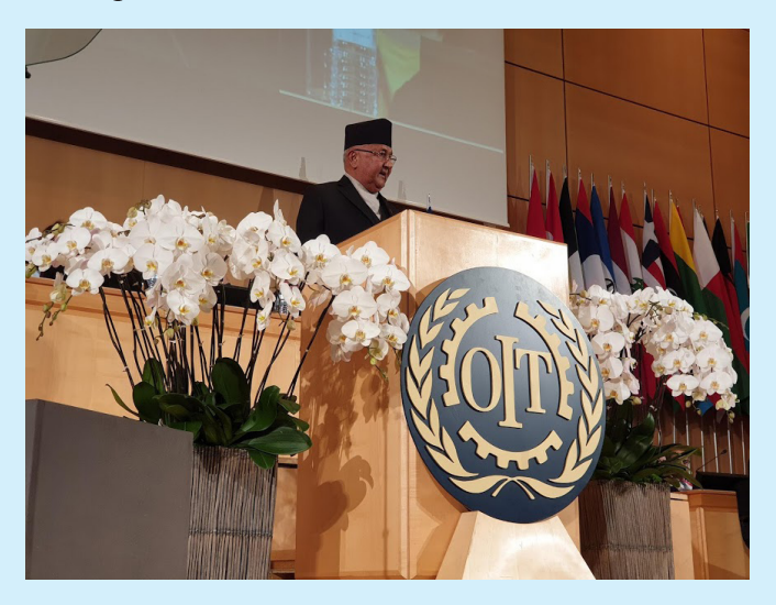
Prime Minister Mr. K P Sharma Oli addressing the ILO Centenary Conference

The Prime Minister Mr. K P Sharma Oli addressed the centenary session of the International Labor Conference in Geneva on 10 June. Addressing the session, the Prime Minister called the Preambular pledges of the ILO's Constitution as the 'moral minimum' and urged international community to demonstrate its renewed commitment to meet and rise above these minimum labour standards. While visualizing Nepal's agenda for decent work under the theme of 'skilled workers, prosperous Nepal and happy Nepali', he elaborated that democracy without economic rights and social justice remains incomplete.