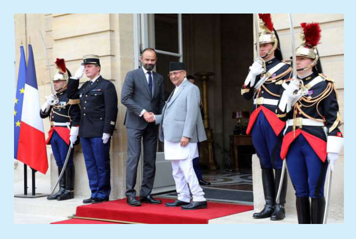
French Prime Minister Philippe welcomes Prime Minister Oli to his office

While Prime Minister Oli commended the continued progress and prosperity achieved by France, the French Prime Minister congratulated Nepal on its historic political transformation and the institutionalization of political gains through the democratic constitution.